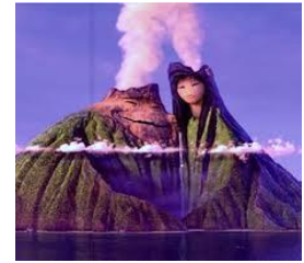
"uku and "Iele"

Intro: C . . . | G7 . . . | F . . . | C . G7 . . .